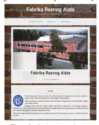
Figure 3 – Explorative application home page

of application, Groovy is used in the logic layer, SOL query language is used communication with the database. For Grails applications development, knowledge of at least three programming languages in different domains is necessary, which means that it requires at least basic knowledge of polyglot programming. Also, Grails offers the possibility of combining other programming languages, because even though the Groovy programming language is inseparable part of Grails framework, Grails can execute the code written in another programming languages. Grails can have plug-ins, with which interoperability with other programming languages like Clojure, Scala and Ruby can be achieved. These plugins represents the Java implementation of the aforementioned programming languages on the Java virtual machine. In controllers, domain classes and the broker database, Groovy and Java